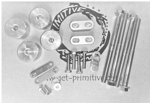
09-18 For, 13-17 XV & 10-14 Outback