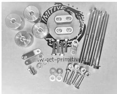
15-19 Outback PRSS Kit