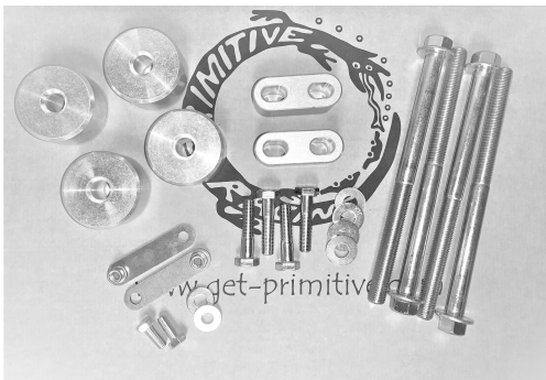
09-18 For, 13-17 XV & 10-14 Outback